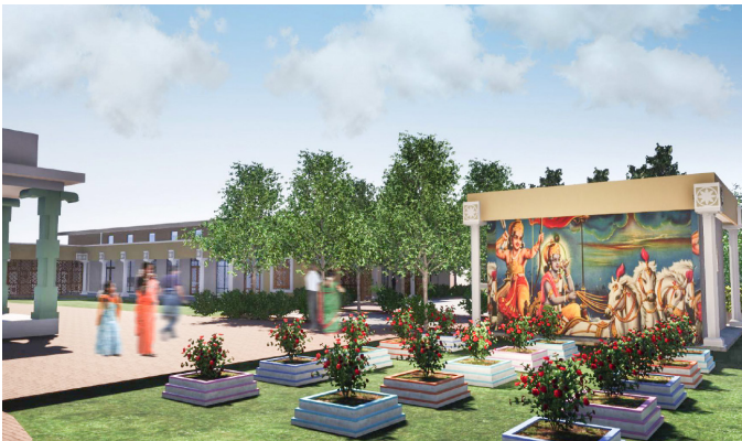
VIEW OF CHARIOT STORE

To provide a building that will facilitate the empowerment of children and young people, especially of migrant communities, to build resilience and acquire appropriate values and life skills that will enable them to reach their potential. The building will also be used to bring together families through cultural, social and community development activities.