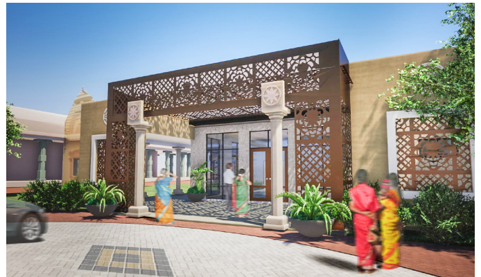
VIEW OF MAIN ENTRY